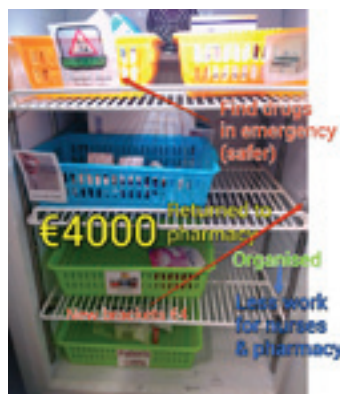
The pharmacy team at Galway University Hospital